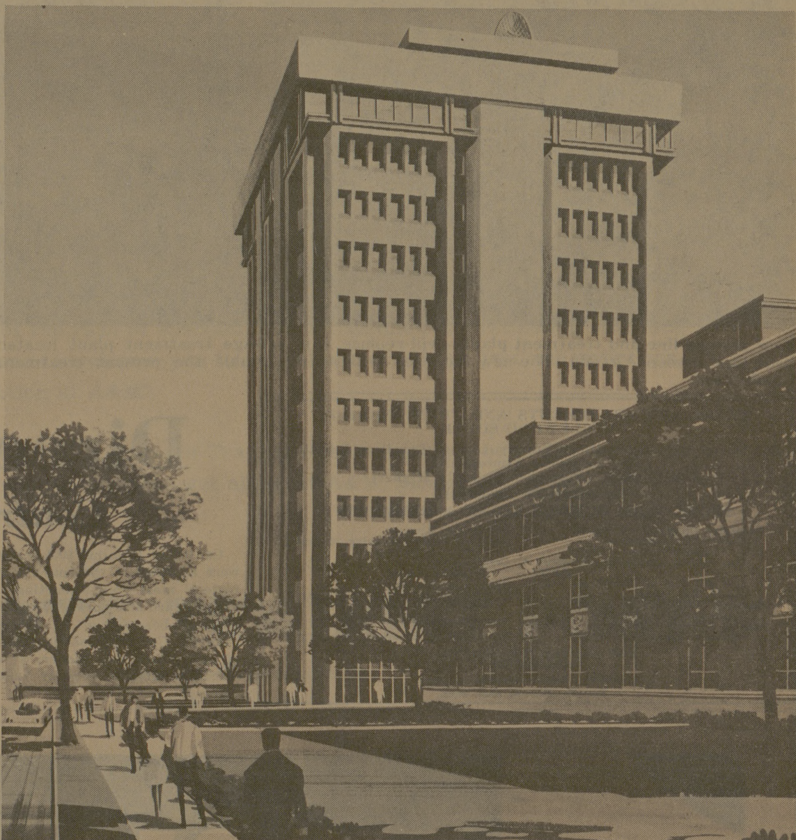
High rise on campus—Construction will start soon on the new 15-story Oceanography-meteorology Building, shown here in artist's concept. The facility will include 121 laboratories. (Related story on page 7)

W. E. Bellows Construction Co. of Houston is the general contractor. Bellows bid $7,546,600 for the two-year project, with the remainder of the costs going for fees, furniture and equipment.