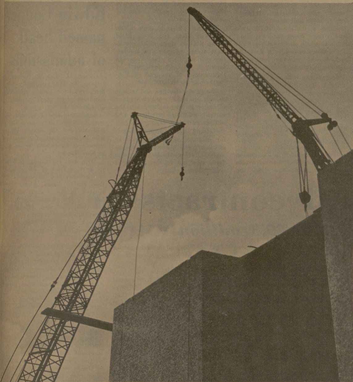
Cranes resemble giant insects over Engineering Center—$9.3 million building due to be ready next fall.