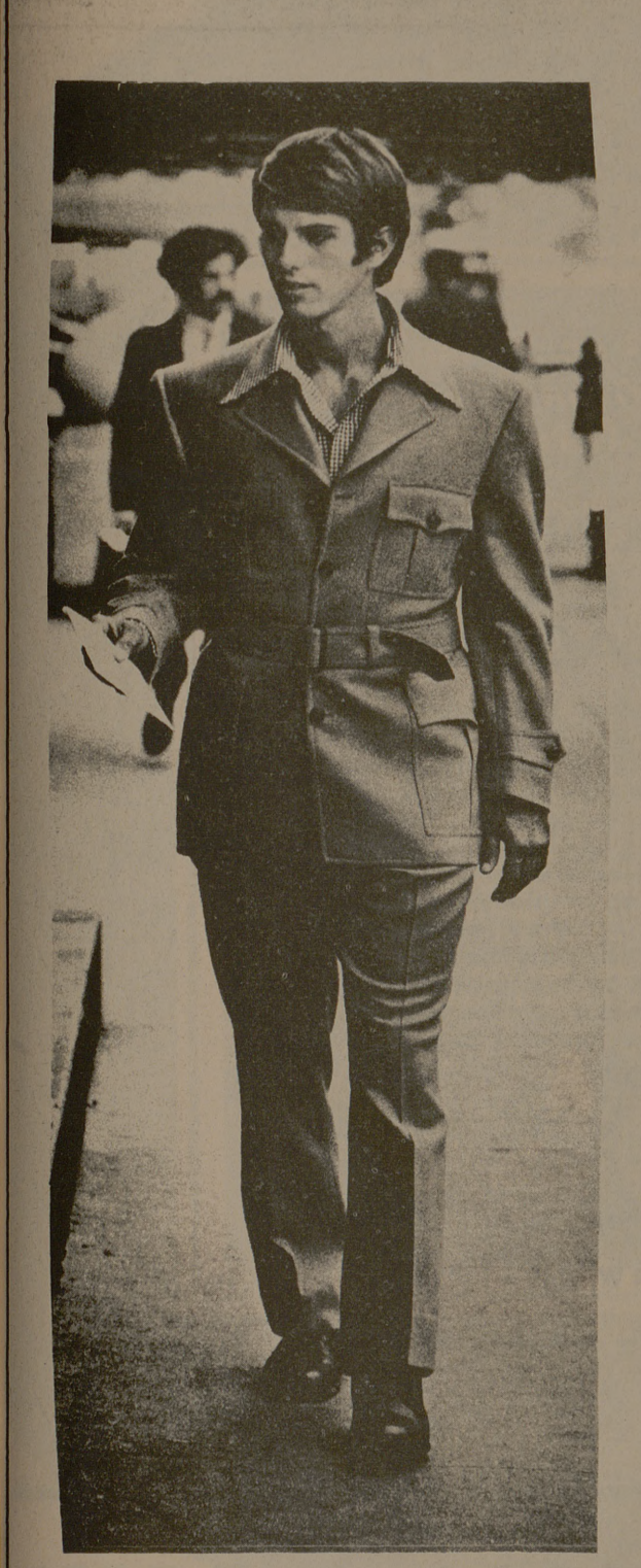
The Belted Look Is Outta Sight