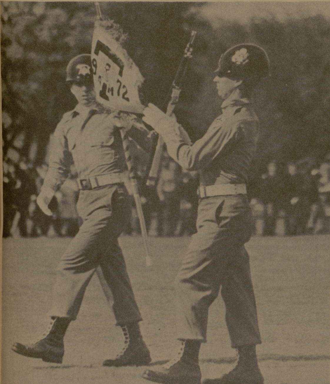
Fancy drill—The right guide and the guidon bearer exchange guidon and rifle in a phase of fancy drill in a meet held last year at Texas A&M. The Fish Drill Team is the present national championship team, even though they compete with upperclassmen from other colleges and universities.