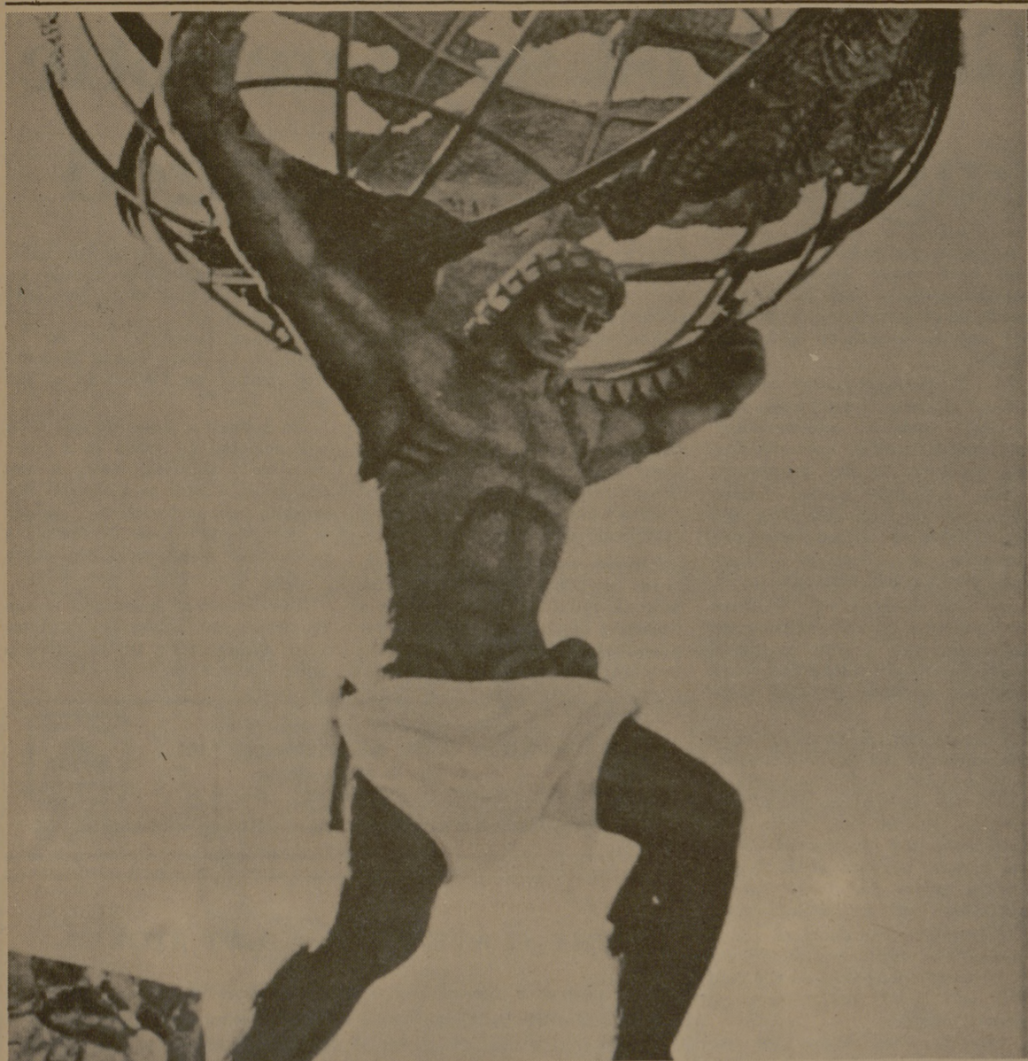
Time for a change?—Evidently it's not enough Atlas must hold up the world, now he may have to hold up his diapers. The statue of Atlas holding the world is in front of an Ogdenville health center, a victim of a prankster, whose motive is uncertain.