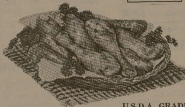
U.S.D.A. GRADE 'A' FRESH DRESSED

WE GIVE DOUBLE STAMPS EVERY TUESDAY WITH $2.50 OR MORE PURCHASE