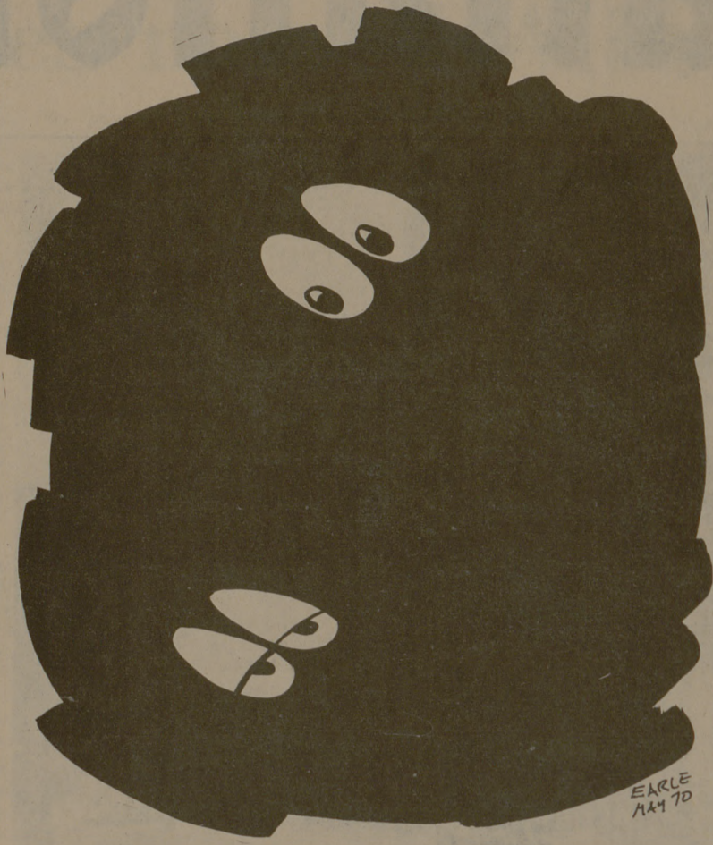
"Are you sure that resting up for finals is more beneficial than studying for them?"