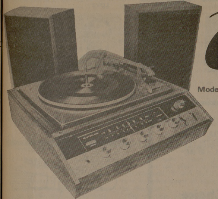
The Kingsbrook Model 34-4030 is a compact 30-watts, all solid state, high fidelity AM/FM stereo multiplex Garrard phonograph system.

USED Monarch Notes—Quiz Reviews You pay 25¢ and a 50¢ deposit. Return the books with the Lou price tag and get your 50¢ deposit refunded. It's A Fact — LOU Appreciates Your Business