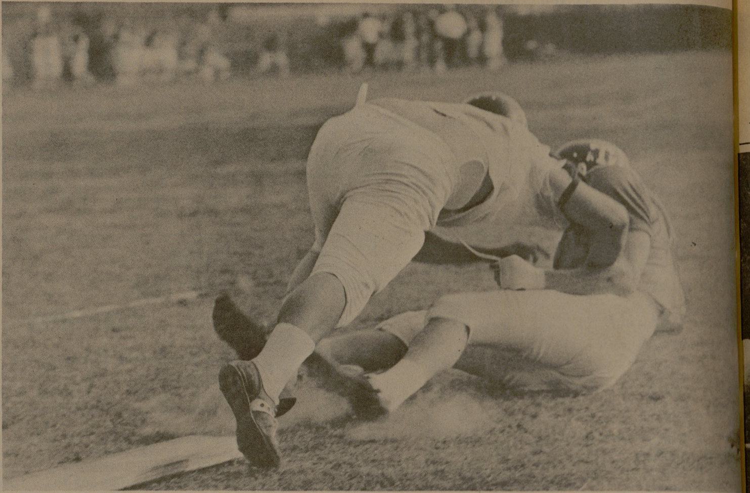
OFFENSIVE BLOCKING—A red defender (right) pays a board blocking drill. The Aggies are in the middle of second week of spring practice.