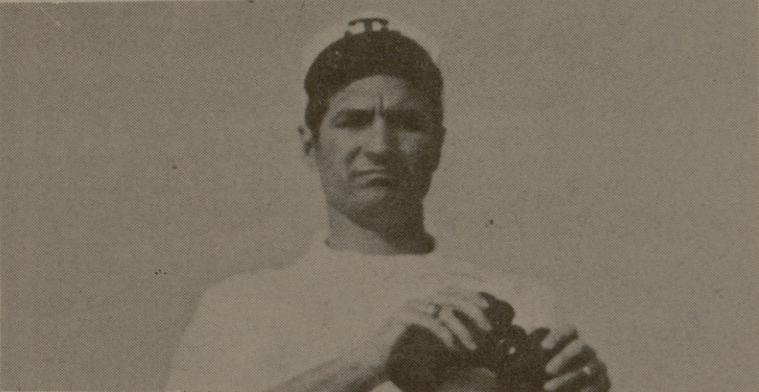
HEAD COACH GENE STALLINGS