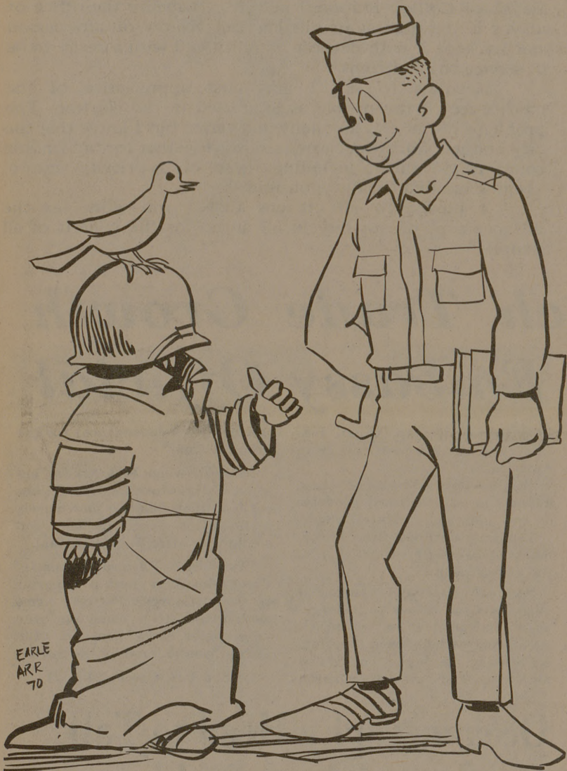
"This is what I dislike about spring!"