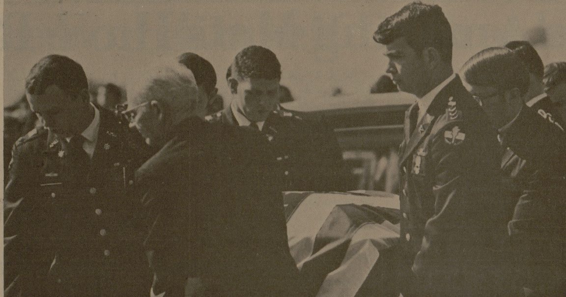
Eight student leaders served as pallbearers while another 40 students formed an honor guard for Gen. Rudder.