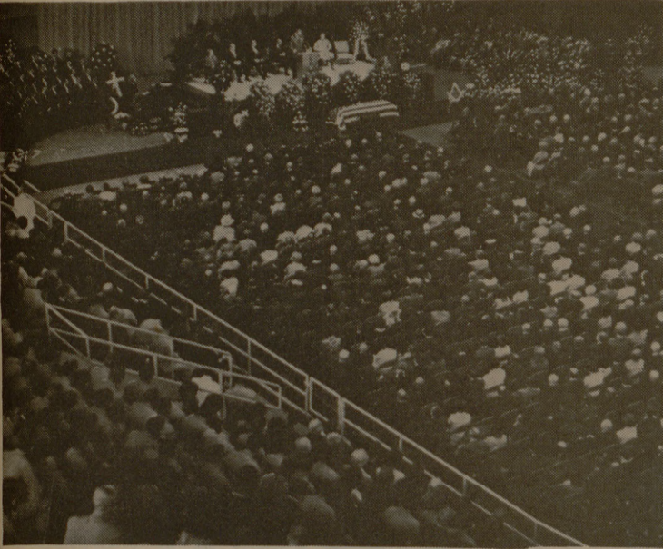
Ten thousand mourners crowded into G. Rollie White Coliseum for the memorial services.