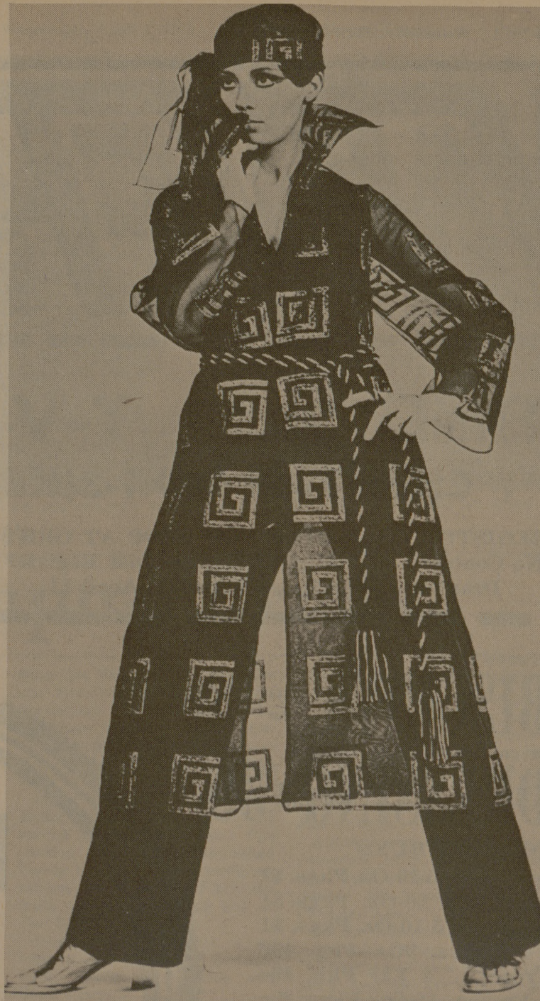
ITALIAN COCKTAIL DRESS—A cocktail dress of black, gold embroidered organdy was presented at the Rome spring-summer fashion show this year. The creation is by the Tita Rossi fashion house of Rome, using the new look of combining a midi-length tunic with pants.

The eye of the future features, "wrap-around" eye-shadow, applied in the area outlined by the dotted line, going under the eye as well as on the top lid.