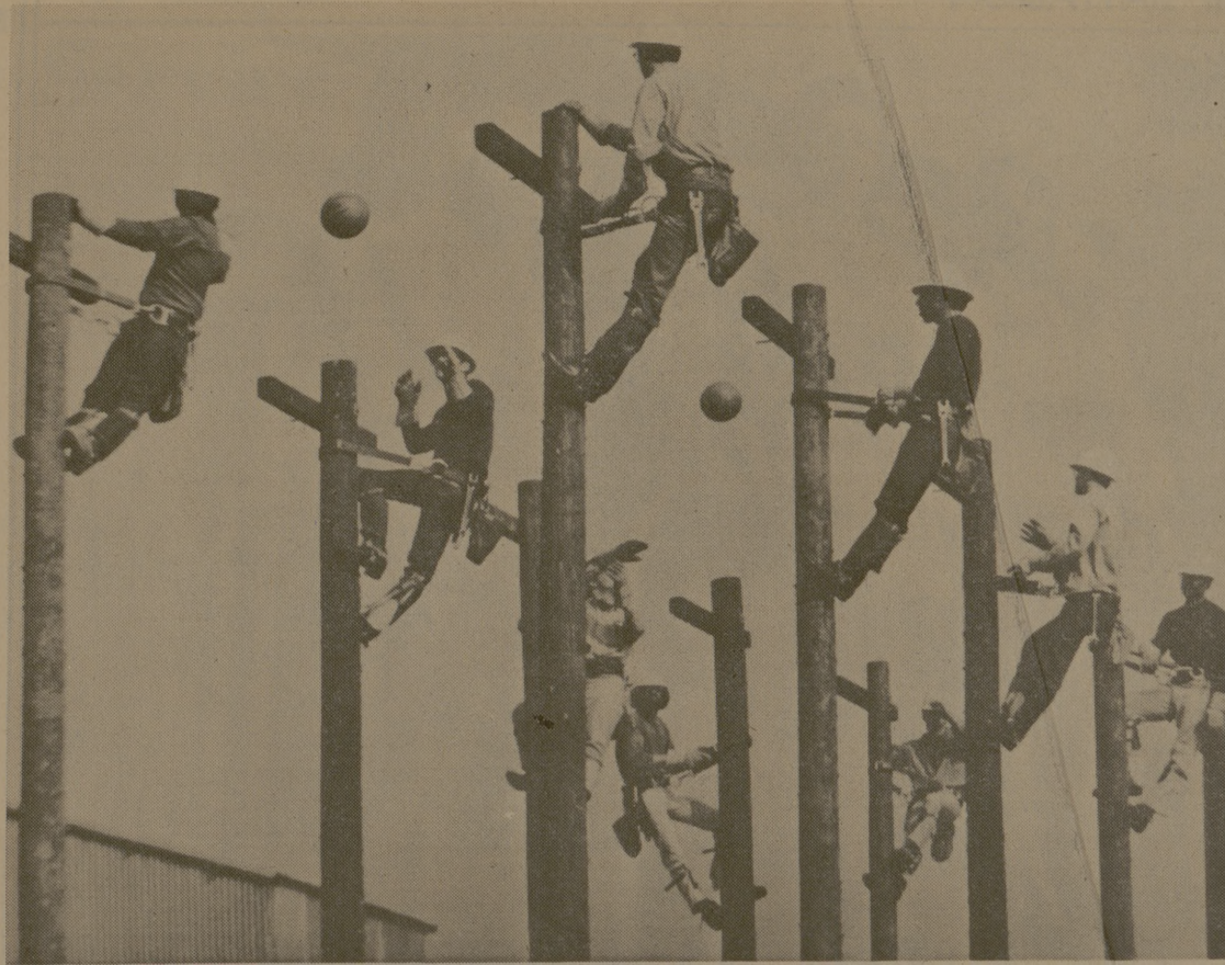
WATCH THE BOUNCING BALL—Trainees at Pacific Telephone's pole-climbing school in Los Angeles toss basketballs to build confidence while perched atop a pole 30 feet above ground. About 600 men a year take the training, still necessary although more lines and cable are going underground.