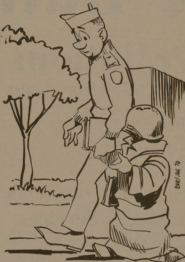
"I was just thinking that if my finals worked out okay, I'd be a half sophomore! There must be some better reason for wanting to do good!"

Saturday a whole new group of graduates step across the line. It is hoped that this group is the most realistic yet in remembering "when."