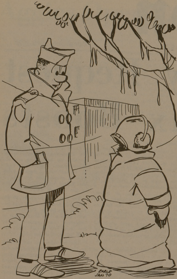
"Somehow I feel warmer just looking at you!"