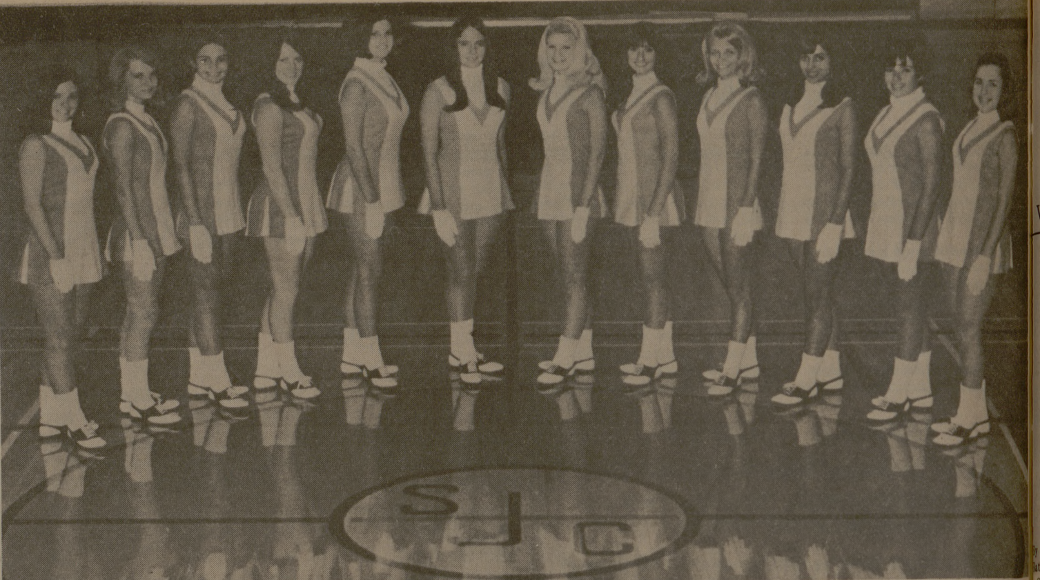
SAN JACINTO SAN JANS

33-11; AYI defeated Davis-Gary, 36-12, and Joe Bierman led Hughes Hall in a 30-24 edging of Crocker Hall. Three one-TD shutout victories marked Class B football results. B-2 downed A-1, A-2 scotched D-1 and F-1 blanked Squadron 10. A-2 gained the playoffs with a perfect record. Two games wound up with goose eggs on both sides, C-1 and C-2 taking wins on penetrations over B-1 and Squadron 3, respectively.