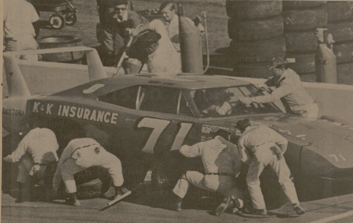
IN CHAMPION FORM Bobby Isaac's expert pit crew works over his car like so many scurrying ants, changing tires, wiping windshields and pouring gasoline. The hustling paid off as Isaac left this stop to come back with the checkered flag.