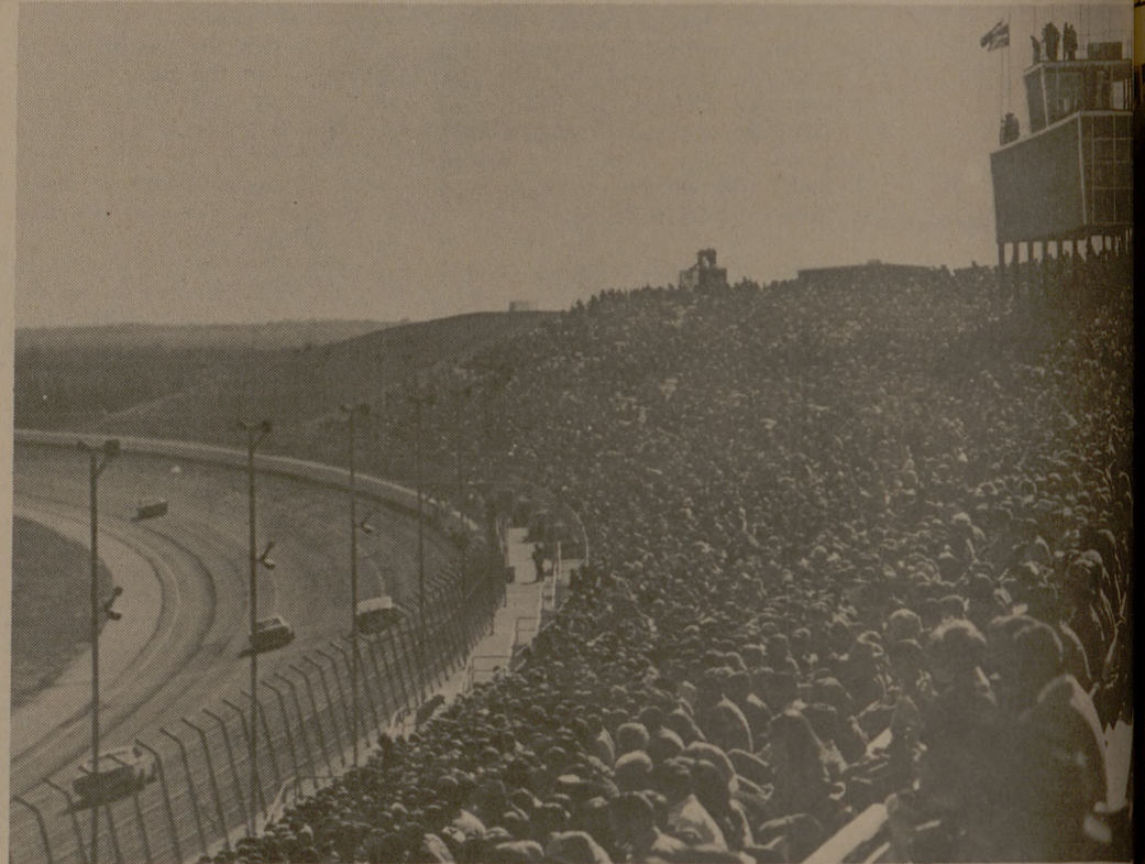
TAKING IT ALL IN Crowds of spectators view the 250-lap, 500-mile race from the speedway grandstands. Towering above them is the press box and, farther down the track, perch for television cameras.