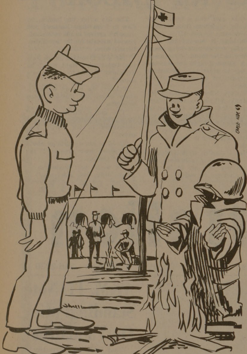
"No sir, we're not guarding the centerpole! We're guarding the guards!"