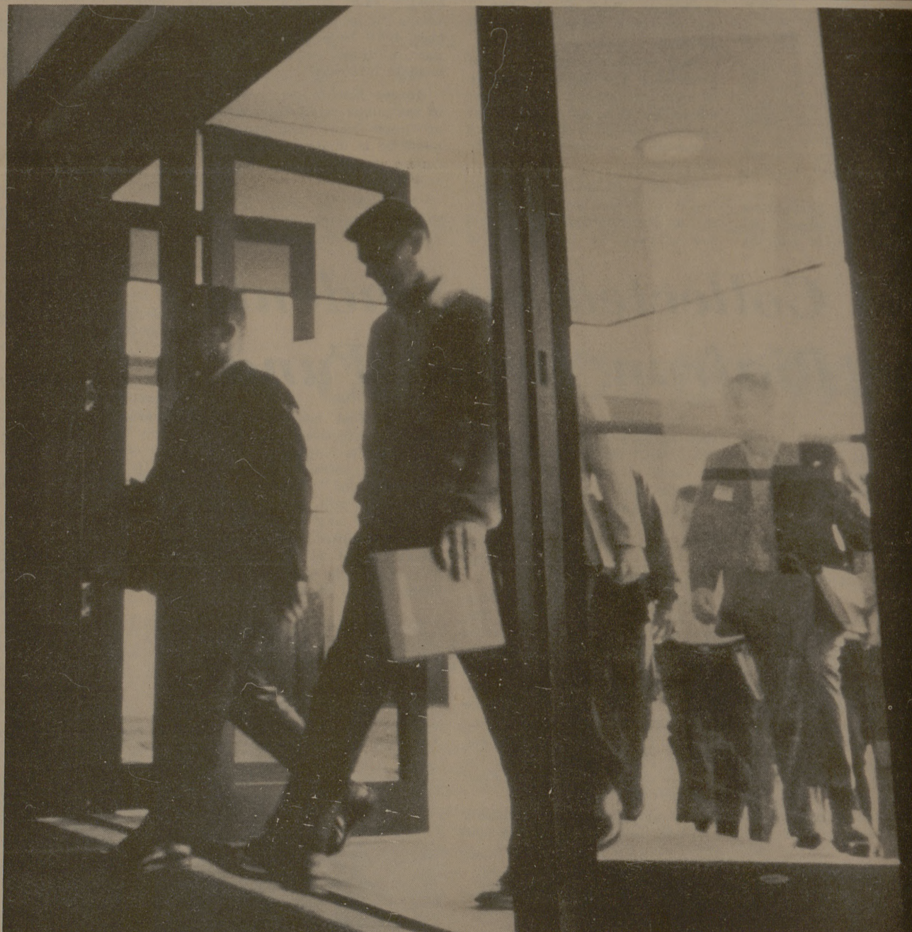
The college you can't get into without a job.

The college is ours—Western Electric's Corporate Education Center in Hopewell, New Jersey. Like your college, ours has a campus with dorms, dining halls, labs and a library. Unlike yours, you can't get into ours without a job. A job at Western Electric. Our students—engineers, managers and other professionals—develop and expand their skills through a variety of courses, from corporate operations to computer electronics. To help bring better telephone service and equipment, through the Bell System. For information contact your placement office. Or write: College Relations Manager, Western Electric Co., Room 2500, 222 Broadway, New York, New York 10038. An equal opportunity employer.