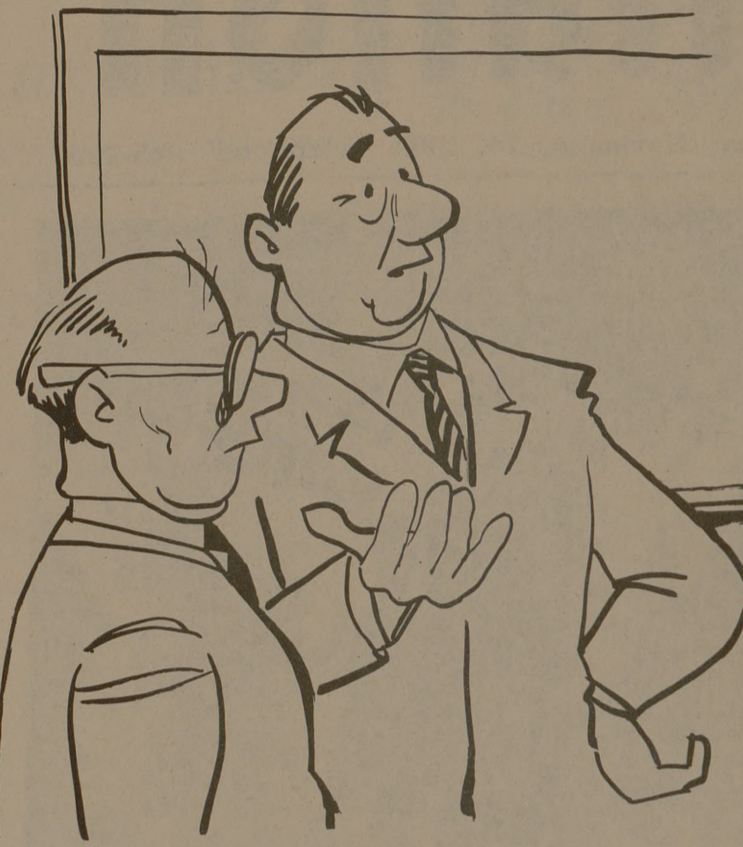
"Seven had grandfathers who died, five grandmothers, and two had uncles! One student's grandfather died again after dying on the last corps trip weekend!"

One comment made by a retired Army general who spoke at the University of Oklahoma Moratorium was this: "The most ardent and sincere pacifist in the world is one who has been shot at." He added, "And I have been shot at."