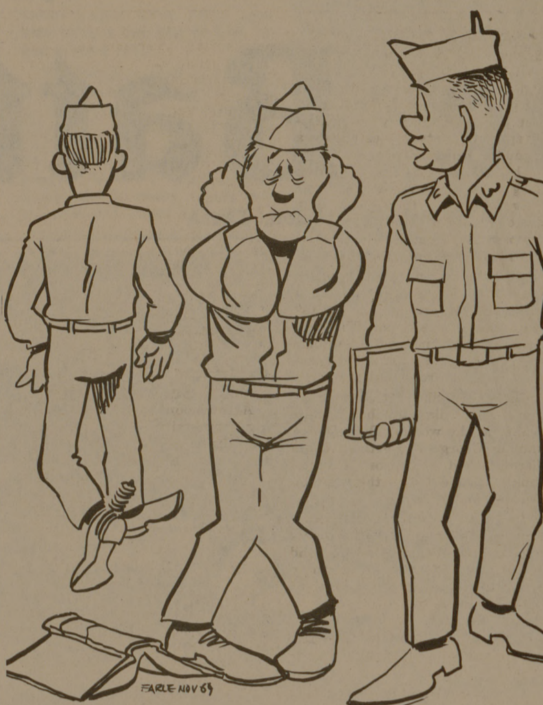
"Now that's what I call a real 'Howdy'!"

So if you want to change something, say something, "silent majority." You've got some people listening to you who can help.