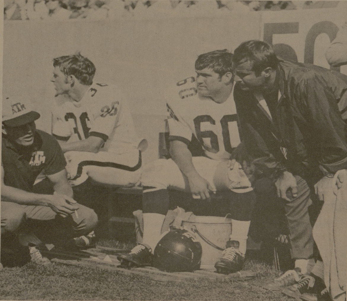
DISCUSSING DEFENSE PLANS