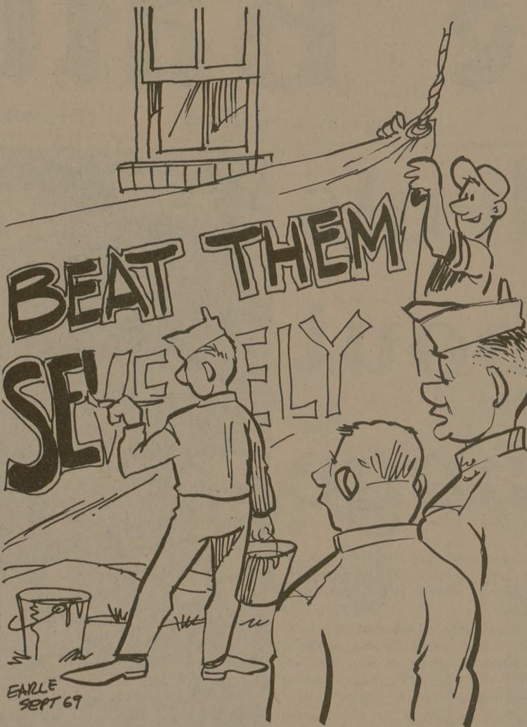
"Since last week's football sign was a little off-color, we thought we'd do a change of pace 'til the heat's off."