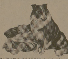
"FAITHFUL PROTECTION SINCE 1910"

LIFE INSURANCE COMPANY EXECUTIVE OFFICES WACO, TEXAS