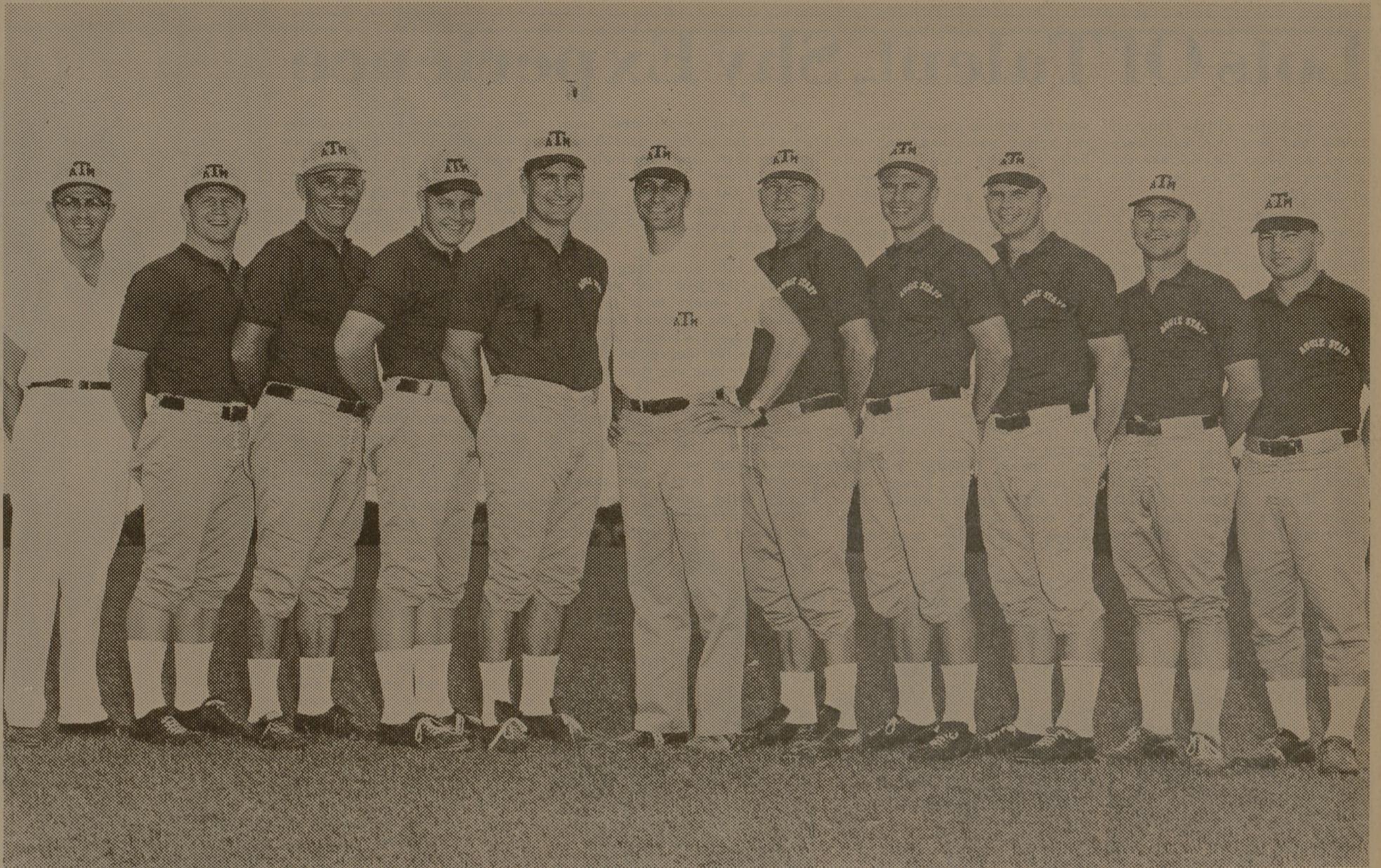
1969 AGGIE FOOTBALL COACHES