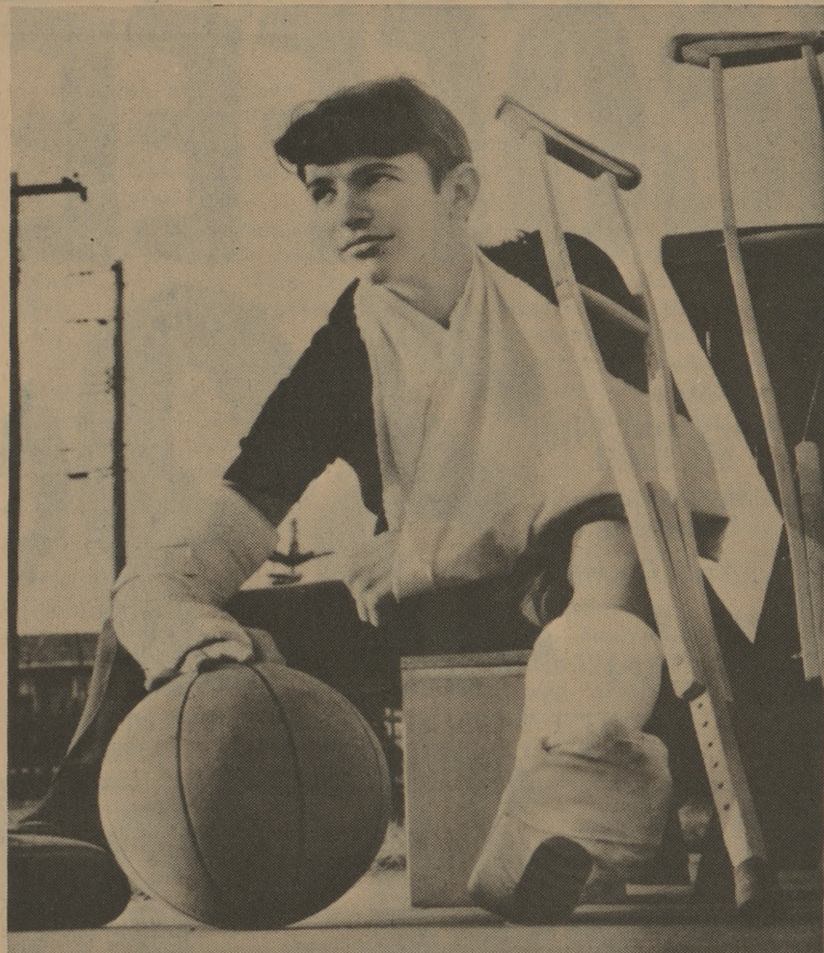
BREAKS OF GAME

The Aggies have Baylor here next Tuesday and then go to TCU on Friday, May 2.