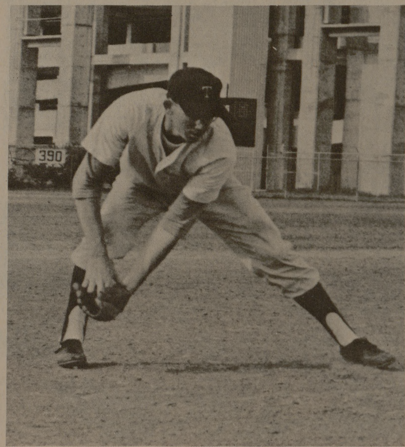
NICE AND EASY

An Equal Opportunity Employer U. S. Citizenship Required