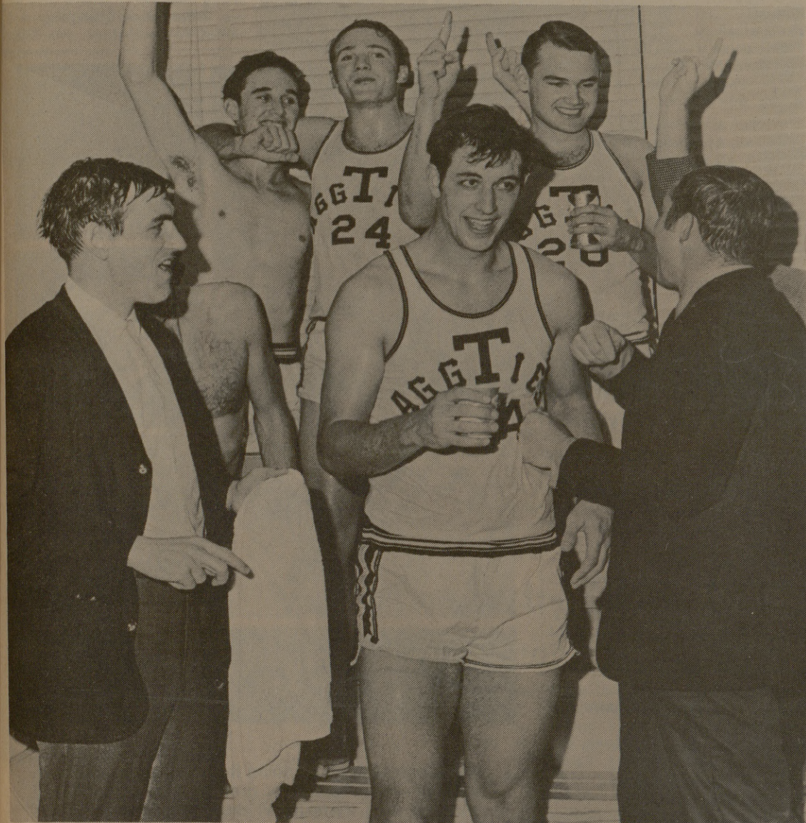
WE'RE THE GREATEST