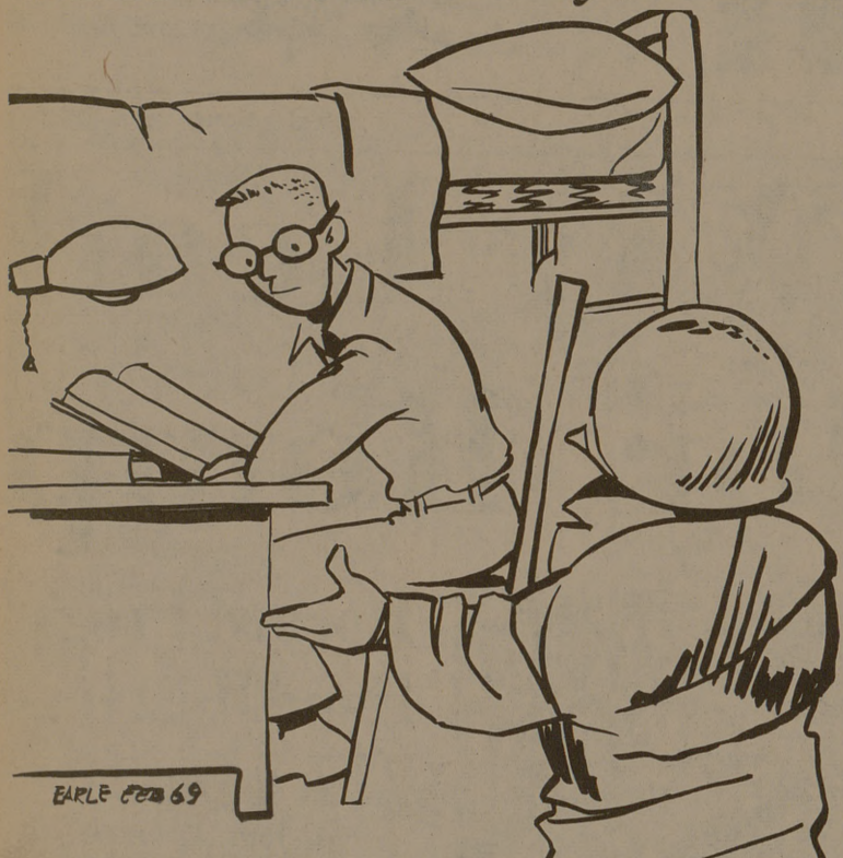
"Why are you studying now? Your quiz is not until the day after tomorrow!"