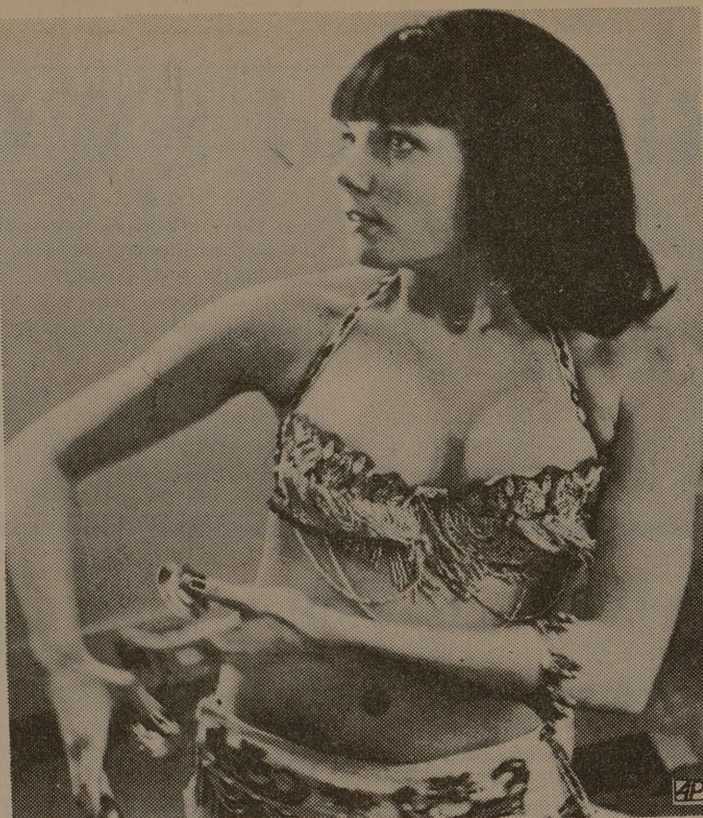
WIGGLING HUBBY THROUGH COLLEGE