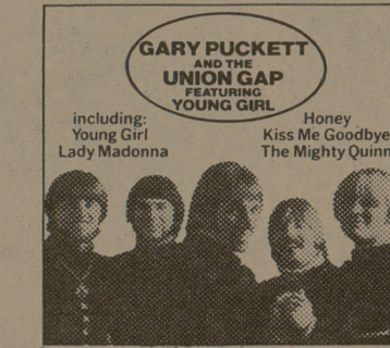
On Columbia Records