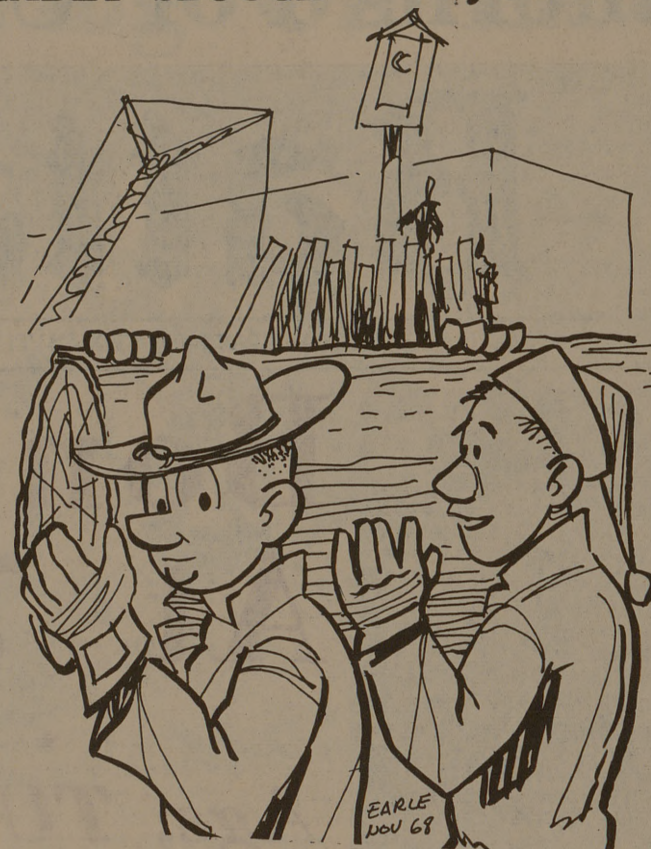
"I wonder how the sips feel, knowing that our team is serving as the screening committee for the Cotton Bowl?"