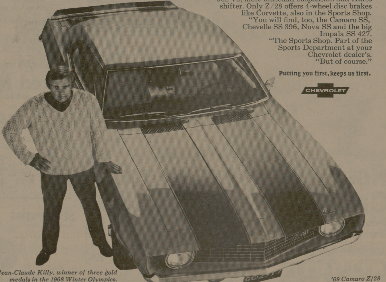
Jean-Claude Killy, winner of three gold medals in the 1968 Winter Olympics.