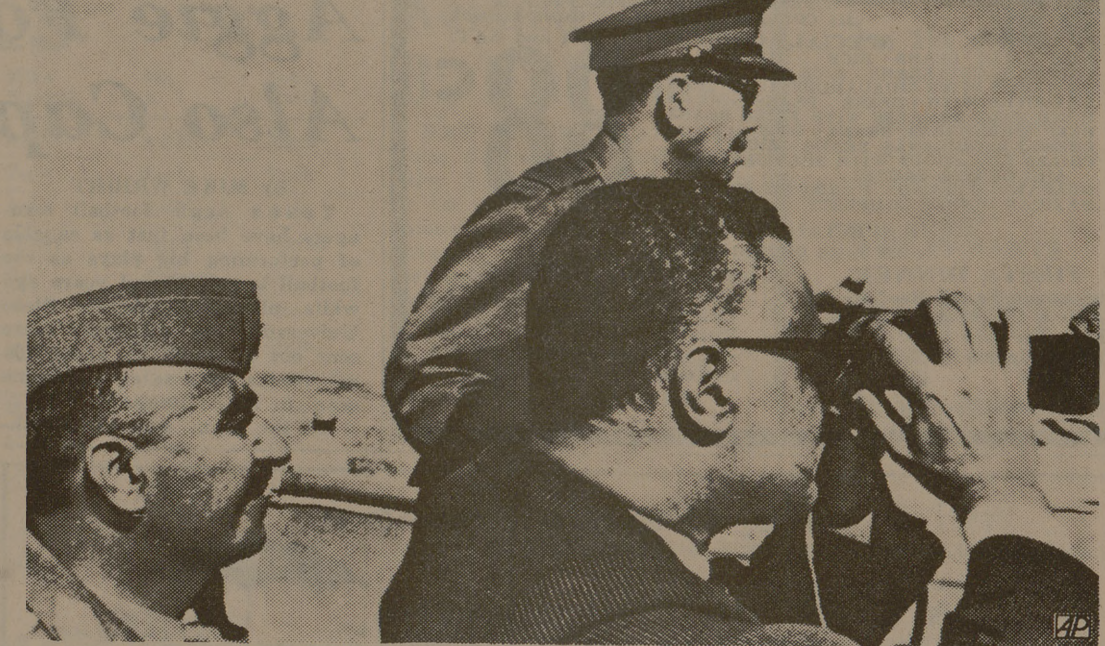
A LOOK INTO THE FUTURE? Egyptian President Gamal Nasser looks through field glasses at a military drill operation of Arab air and ground forces along the Suez Canal cease-fire line. At left is Deputy Prime Minister of Iraq, Salih Ammish and Mohammed Faqzi, commander-in-chief of Egyptian Armed Forces in the rear.