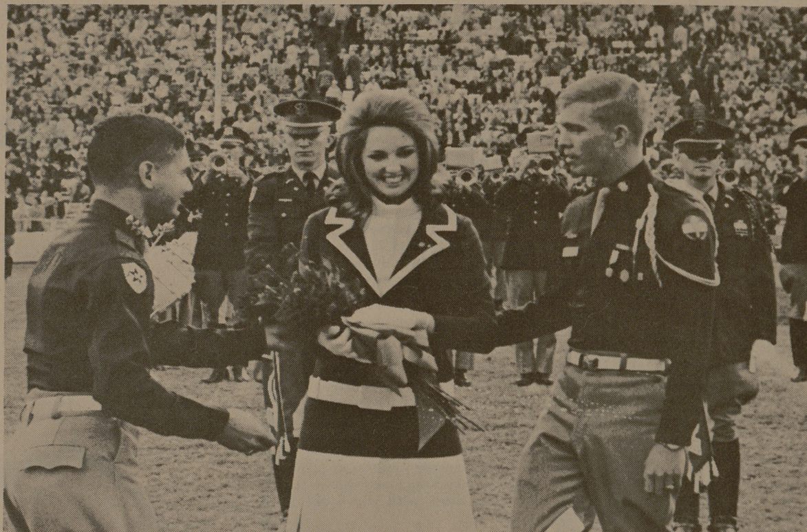
ROSES FOR THE SWEETHEART

The committee said, "It is apparent that the major complaints registered against the food in the union are not motivated by the quality of food served but stem from the physical appearance and environment of the Chuck Wagon and Commons."