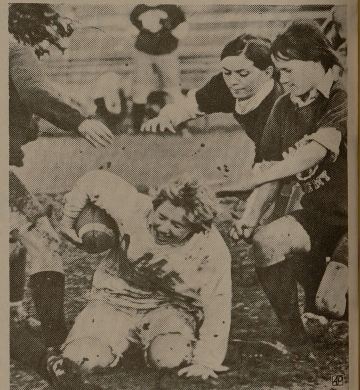
FIRST AND TEN?

Although A&M previously decided to participate in the contest for NCAA "College Football Centennial Queen," the selection committee may decide not to enter the contest if none of the applicants has the right qualifications.