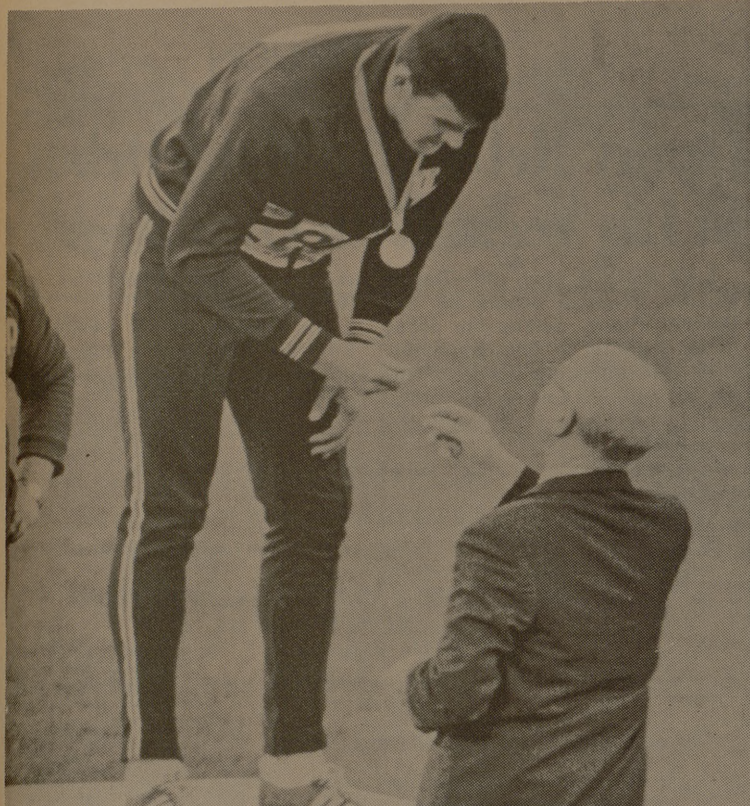
RECEIVES GOLD MEDAL

Leopards. At this point the Leopards are still seeking their first win of the season after playing some of the stronger teams in the state.