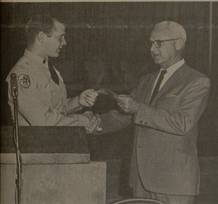
CAMPUS CHEST KICK-OFF

flected in three gold disks for million-record sellers "Till There Was You," "Paper Roses" and "In My Little Corner of the