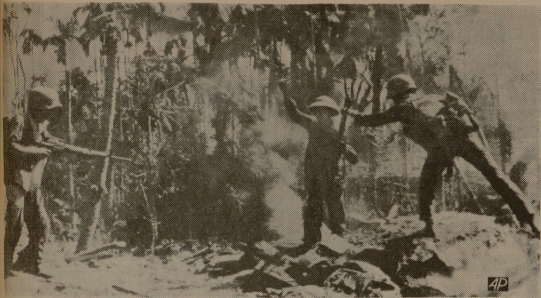
DISARMING THE ENEMY

"They are products of an era, when a great school opened its doors to the boy that wanted an education but whose monetary funds were low," Brown explained. "They were boys without much money but who would have fought if you had called them poor."