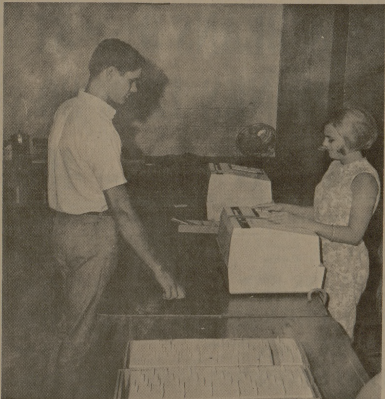
AUTOMATIC FEE ASSESSOR