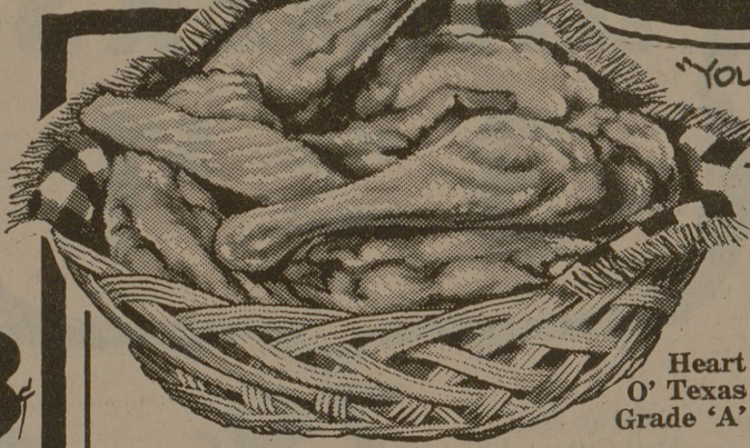
Heart O' Texas Grade 'A'

WHOLE FRYERS 2 1/2 LB. ANG. WHOLE Only LB. 27¢ CUT-UP or SPLIT.... LB. 33¢ LEG QUARTER..... LB. 33¢ BREAST QUARTER... LB. 30¢