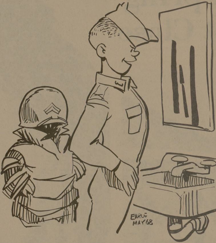
"The closer I get to being a sophomore, the more I realize how much next year's freshmen will need our guidance!"

BRYAN RADIO & TV SERVICE INC. 1301 S. College 822-4862