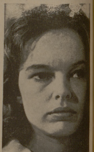
Sandy Dennis In "SWEET NOVEMBER"