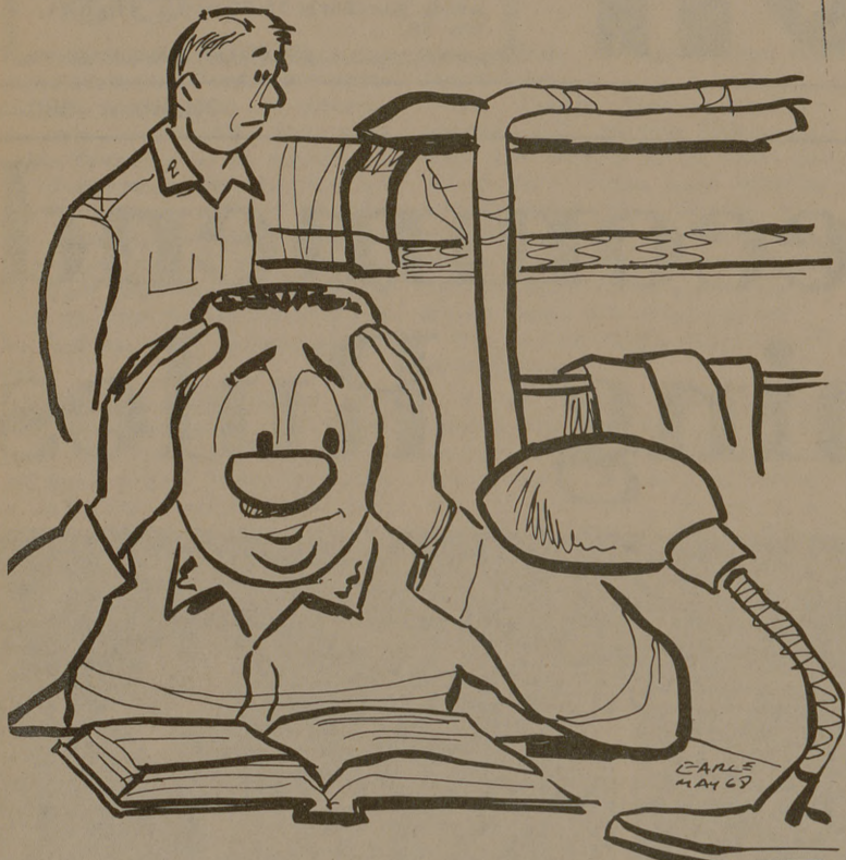
"If you think Federal Inspection was tough, wait 'til our Mothers hit this room Sunday!"