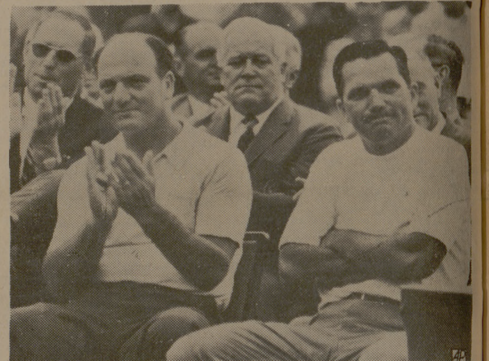
LOSER AND WINNER OF MASTERS Bob Goalby, right, sits with a wry expression as Roberto de Vincenzo applauds the new Masters golf champion at Augusta, Ga. De Vincenzo lost tie when he signed erroneous scorecard and finished second.