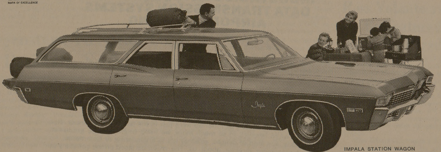
IMPALA STATION WAGON

Chevrolet Tri-Levels TRY ONE FOR SIZE AT YOUR DEALER'S.