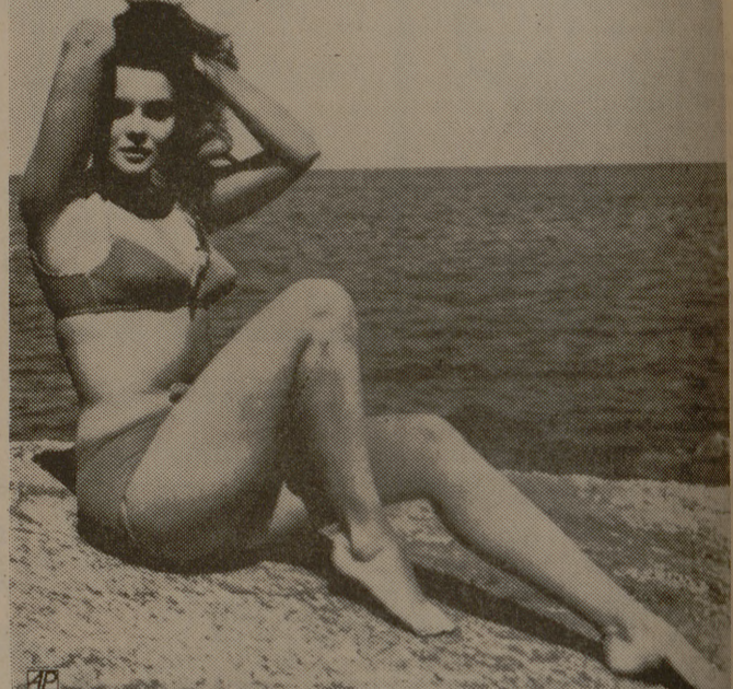
AN EYE OPENER American actress Ann-Margaret is a sight for all eyes as she does some sunbathing at a beach in Beirut, Lebanon. She is in the city making a new film, "Rebus."

He stresses it is made up of many commodity systems with individual characteristics that must be taken into account in any detailed analysis.