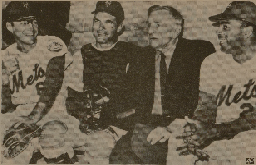
CASEY STENDEL MEETS THE NEW METS Casey Stengel visits New York Mets at St. Petersburg, Fla., and greets three players acquired from Chicago White Sox: From left, Al Weis, J. C. Martin, and Tommy Agee. Stengel is Mets' vice president.