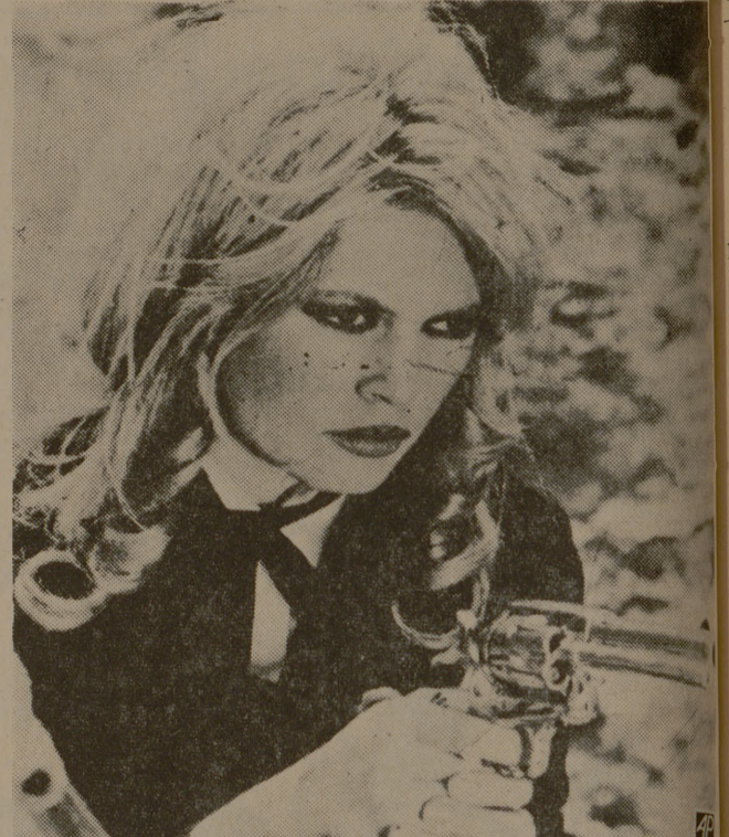
HER AIM IN FILM ROLE