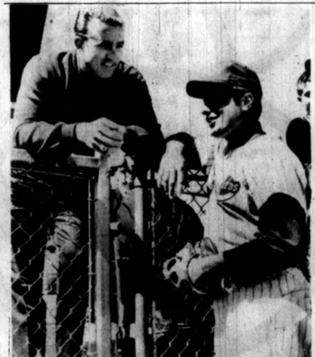
MALONEY OUTSIDE LOOKING IN

Jim Maloney, left, Cincinnati Reds pitcher who has not come to terms with the club, visits with Reds pitcher Mily Pappas on a stop at the Red's training camp at Tampa. Maloney was a fifteen-game winner last season and Pappas was credited with 16. (AP Wirephoto)