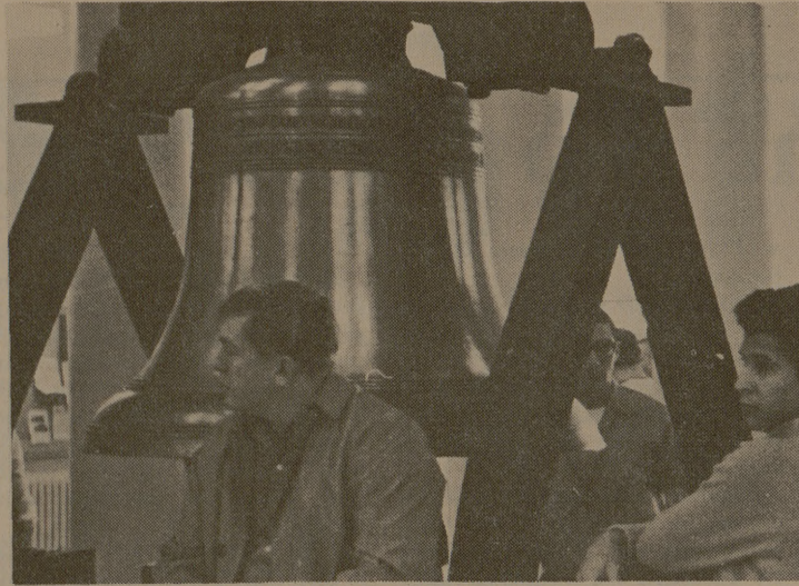
LIBERTY BELL REPLICA

Season tickets may be purchased at MSC student programs: faculty $5.00; students $3.00. Children admitted free.