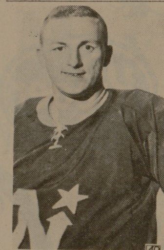
HOCKEY PLAYER DIES Center Bill Masterton (above) of the Minnesota North Stars hockey team died after suffering a head injury in a National Hockey league game. He never regained consciousness.

By the time he got to high school he was a heavyweight tackle and some tried to tag "Fat Boy" on him. It was soon forgotten and he remained "Bones."