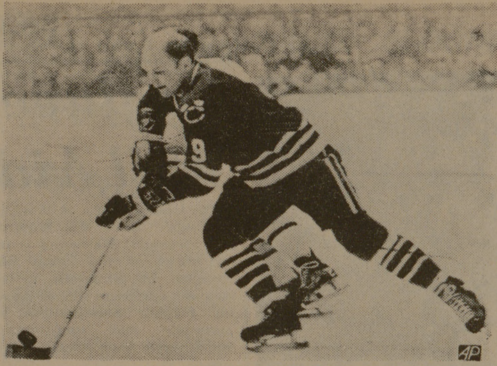
THE FLYING HULL

Bobby Hull of the Chicago Black Hawks moves down the ice with the puck during action with the Boston Bruins in Chicago. Hull scored the 400th and 401st goals of his career during the Hawks triumph over Boston 4-2.